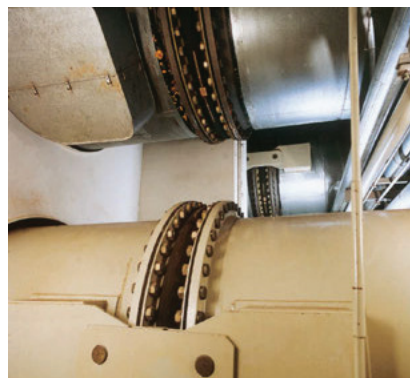
STENFLEX® type C-1 with special high restraints in cooling water system of a power plant

Subject to technical alterations and deviations resulting from the manufacturing process.